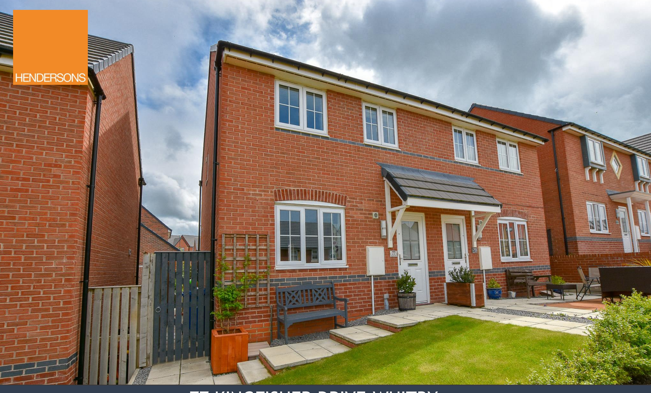
77 KINGFISHER DRIVE, WHITBY Monthly Rental Of £975